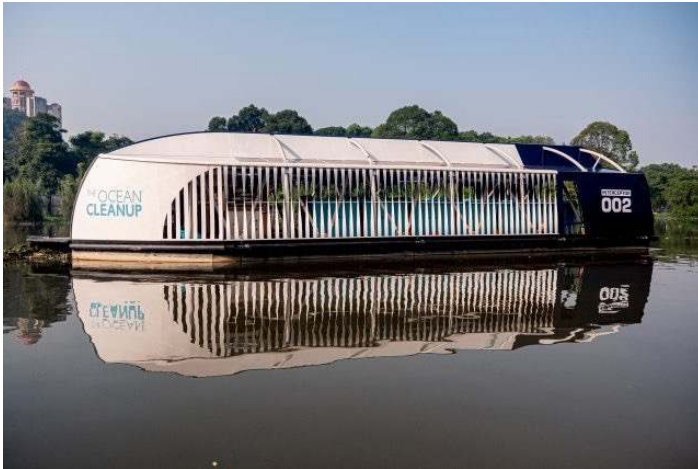
Image 3: Interceptor in Klang River, Malaysia. It helps to prevent plastic release from river to oceans.