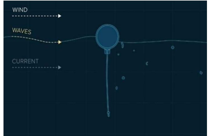
Image 4: Floating system used by The Ocean Cleanup to remove floating plastic from ocean.

process in which sunlight breaks down plastic into smaller fragments. Microplastics are less than 5mm in length. Microplastics constitute 94% of the patch formed out of over 1.8 trillion pieces of plastic. Although abundantly present in the ocean, these microplastics are so small that even satellite images are not able to capture them. A recent discovery showed that about 70% of the garbage sinks to the bottom of the ocean. And as expected the plastic patch blocks sunlight from reaching the plankton and algae; thus, hindering their growth. This patch is hazardous not only for plants but also for marine animals since they mistake plastic for food. An estimated 100,000 marine animals are strangled, suffocated, or injured by plastics every year. About 46% of the garbage island is fishing nets. Animals get tangled in fishnets and cannot extract themselves out. Such interaction is known as ghost nets and can be fatal for the organism.