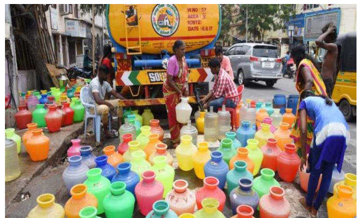
Image 2: Chennai water crisis. People lined up near water tanker to draw water for their daily needs.

2019 (Image 1). Another reason for water crisis is the presence of household wells and private water tankers which overexploit groundwater level leading to deeper dug wells in search of groundwater and limited recharge during monsoon season. The worst affected areas were slums and lower-income societies, they received as little as 30 litres of water each day. From July 7, 2019, that is 18 days after the crisis began, Chennai Metro Water Supply and Sewage Board (CMWSSB) tankers started distributing 10