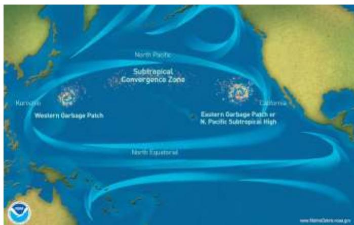
Image 1: Formation of the great Pacific garbage patch by convergence of the east and west garbage patch.

North Pacific garbage island, also known as the Pacific vortex, is an exemplar of marine debris. It is a garbage island formed by two mini garbage patches located on either side of the world (Image 3). One in the west, near Japan and the other in the east formed between Hawaii and California (both in the USA). These two mini debris islands converge in the Pacific Ocean because of North Pacific Subtropical Gyre. Gyre means rotating currents; it can either be in the atmosphere or ocean. North Pacific Subtropical Gyre is one of the five major ocean gyres. It consists of four currents rotating clockwise. The four currents are- California current, North Equatorial current, Kuroshio current, and North Pacific current. Center of the gyre is very calm and stable because of its circular motion. It does not let any debris ever get out of it. Thus, forming a circular moving garbage patch. The major reason why this garbage patch has been expanding over the years is that it is made up of non-biodegradable materials chiefly plastic. Plastic remains on the surface of the water because it is less dense than water. But over time, because of photodegradation, it breaks down into tiny particles called microplastics. Photodegradation is a