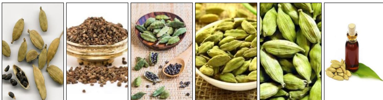
Figure 3: Green and dried Cardamom, seeds and oil.

infections, if any. This is a given. Improved scalp health most often means stronger and better-looking hair. The spice strengthens your hair roots and offers shine. The spice helps treat skin allergies and improves skin complexion. It can also be used as a tool to cleanse the skin. One of the benefits of cardamom is that it imparts in making fair skin. Cardamom essential oil helps in removing blemishes, thus giving a fairer complexion. The skin benefits of cardamom can be attributed to its antibacterial and antioxidant properties. Cardamom contains vitamin C, which is a powerful antioxidant. It improves blood circulation throughout the body. Also, the many layers of phytonutrients in the spice can improve blood circulation – which invariably enhances skin health. [9-12]